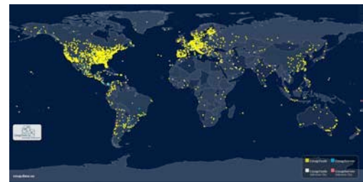
Figure 1. CmapTools users throughout the world.

The 2000's have seen a continuous growth in the use of concept mapping and in its applications. This growth is reflected in the extensive participation and wide-ranging topics presented at the Concept Mapping Conferences (Cañas & Novak, 2006a; Cañas, Novak, & González, 2004; Cañas, Reiska, Åhlberg, & Novak, 2008) and in the active Cmappers community (the informal community of concept mappers around the world). Figure 1 shows how CmapTools users connecting to CmapServers cover large portions of the world.